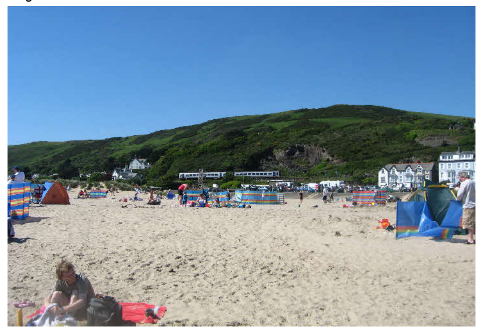
A clear blue sky, sand and holidaymakers on Aberdyfi beach as an unidentified ATW 158 passes by on the 30th May,with the 1209 Birmingham International to Pwllheli.